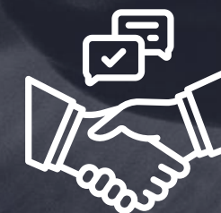
Mediation and interests

With our sufficient experience, we seek to provide appropriate legal solutions in personal status lawsuits, such as proving marriage, divorce, return, annulment of marriage, custody, alimony, visitation, and maintenance, as well as proving endowment, will, lineage, absence, death, determining the heirs, and dividing the estate, including the property if there is a dispute, or an endowment share, or a will, or A minor or an absent person, and proof of the appointment of guardians, the appointment of guardians and guardians, and their permission for actions that require court permission.