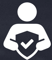
Personal status issues

We provide you with the service of translating all legal documents and texts to and from all languages accurately and reliably by experienced and professional legal translators to ensure accuracy and reliability in legal translation.