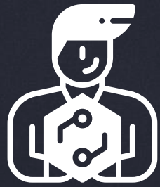
Intellectual property issues

Our company provides services for protecting intellectual property rights, registering patents and trademarks, and preserving the rights of authors and inventors by registering them with specialized authorities.