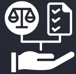
Commitment and governance

Providing the necessary legal support to our clients to ensure that their company adheres to local and international standards of governance and adherence to the regulations and laws in force in the Kingdom by drafting legal regulations that ensure this is achieved.