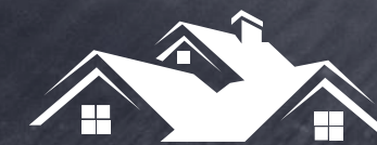
Real estate issues

We provide legal solutions in cases and disputes that may arise between employers and employees or between employees and employers. We also seek to protect the rights of our clients and provide justice.